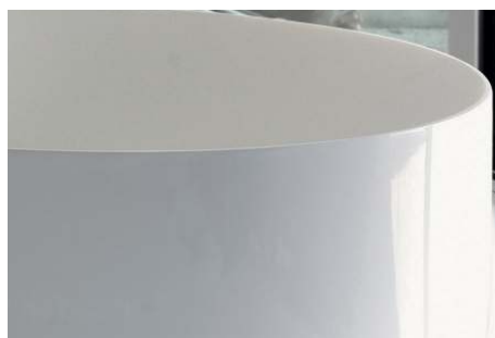
Finitura esterna bianca lucida External glossy finish