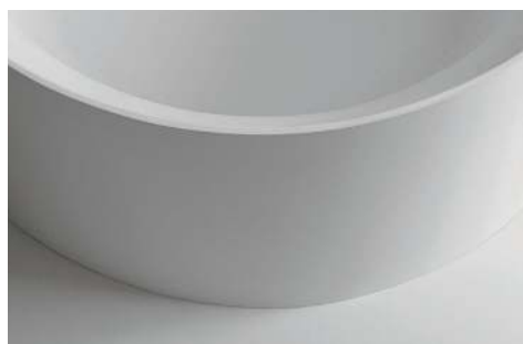
Bordo arrotondato Rounded edge