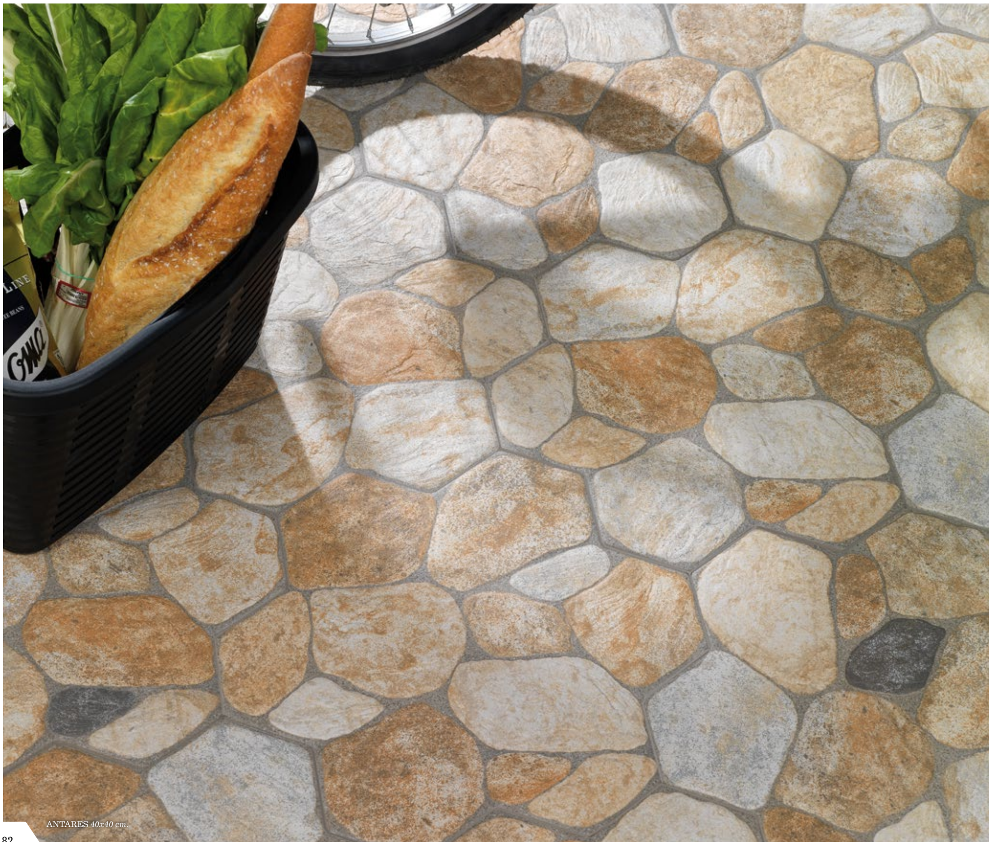
ANTARES 40x40 cm.